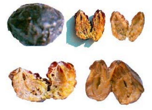
Picture 5. - A) The look of plum fruit dried in vacuum B) The cut of the fruit before and after rehydration

Moreover, the absorption ability of dried fruits is such that it is necessary to take care of their storage considering they return quickly a part of moisture (depending on the relative moisture of the ambient air), which can bring about the emergence of mould.